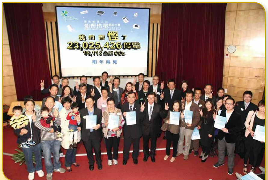
BEA was named Company Champion in the FoEHK's "Power Smart" Energy Saving Contest in the "Biggest Percentage Saver" category.

本行參與地球之友舉辦的「知慳惜電」節能比賽，在節能工作上有良好表現而獲頒「勁減百分比大獎（公司組）」之冠軍。