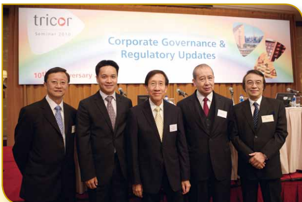
Tricolor's corporate governance seminar in Hong Kong was attended by over 700 people.

在2010年，卓佳馬來西亞辦事處舉辦為期兩天的捐血及捐贈器官推廣宣傳活動，是項活動獲得馬來西亞政府衛生部及國家器官及細胞移植中心的支持。