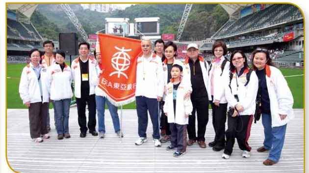
A responsible corporate citizen, BEA actively supports programmes and events organised by The Community Chest of Hong Kong. 本行熱心支持公益金的慈善活動，履行良好企業公民的職責。

The Bank sponsored the Haven of Hope Fundraising Golf Tournament, which raised funds to promote harmonious family relationships. 本行贊助靈實高爾夫球慈善賽，為社區健康及家庭服務籌募經費。