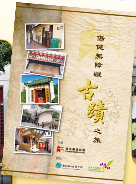
Blue Cross supported the "Barrier-free Visit to Historic Sites" programme, which brought people of different abilities together on equal terms.