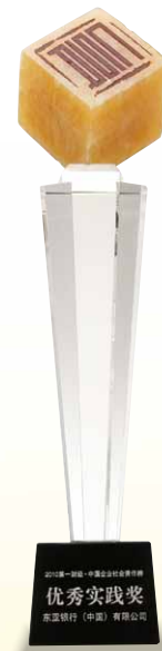
BEA China received the “Good Practices in Social Responsibility for Chinese Enterprises Award” and the “Best Corporate Social Responsibility Award 2010” in the banking category from SOHU.com.