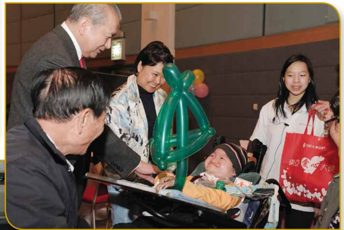
BEA’s staff members volunteered to organise a fun-filled party for SMA patients and their families.