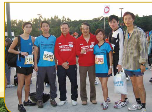
Tricolor staff members participated in "the UNICEF Charity Run 2010" and "The 5th Hong Kong & Macau O! Day".

卓佳員工積極參與「聯合國兒童基金會慈善跑2010」，以及救世軍主辦的「第5屆港澳定向追蹤日」。